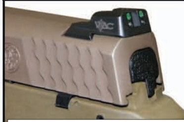
VTAC® Warrior Rear Sight