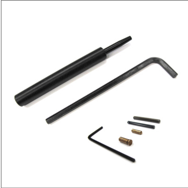
M&P10 Safety Takedown Kit $9.99