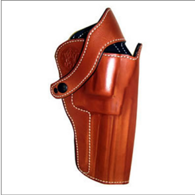
Right Hand Model 460 5" Tan Leather Holster $135.95