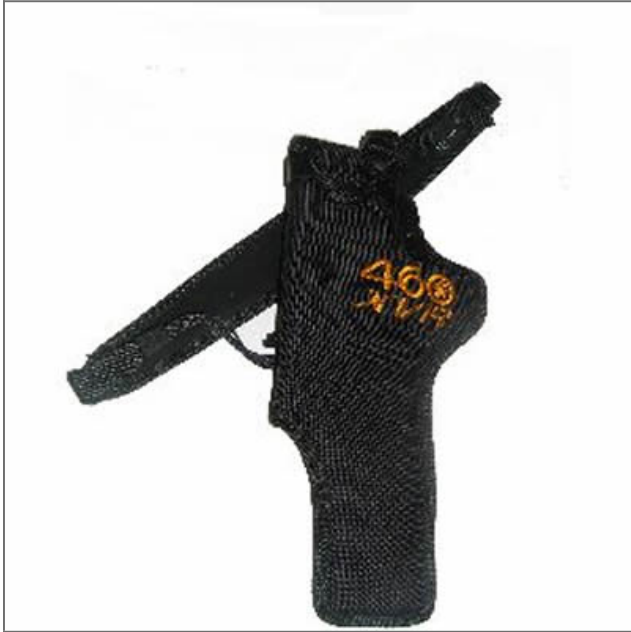
Left Hand M460 8-3/8" Nylon Holster $69.95