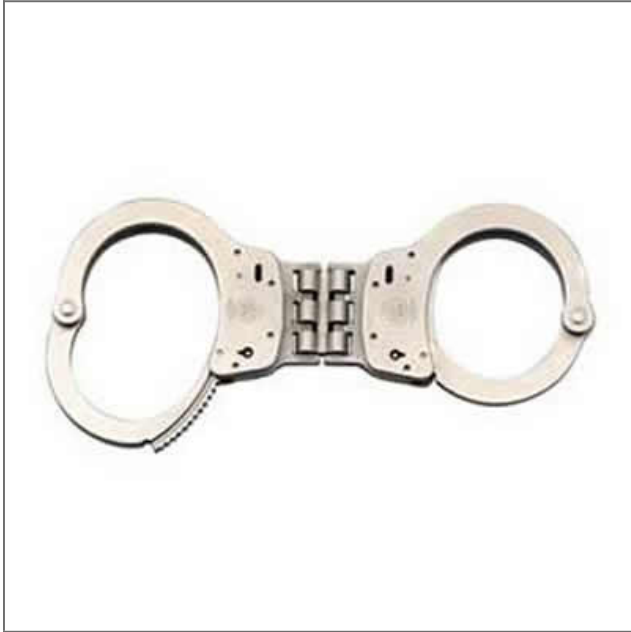
Model 300 Hinged Nickel Handcuff $44.49