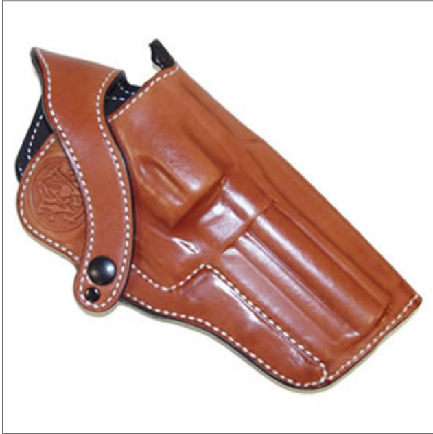
Right Hand Model 500 4" Tan Leather Holster $135.95