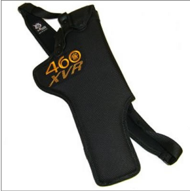
Right Hand M460 8-3/8" Nylon Holster $69.95