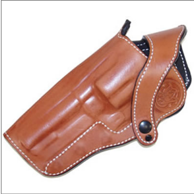
Left Hand Model 500 4" Tan Leather Holster $135.95