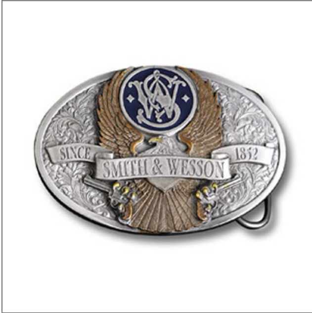
Pewter Eagle w/Enamel Buckle $10.95