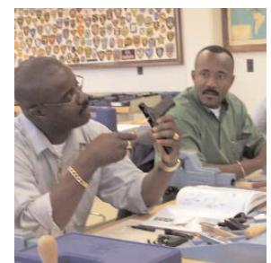
Officers from Barbados participating in an Armorer's course.

Wherever the students called home, they all agreed that the caliber of instruction was superb, the facility was state-of-the-art, and the price was right! All in all, the 35th Anniversary Week was a smash success.