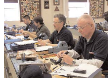
Students at the SW99 Armorer's School