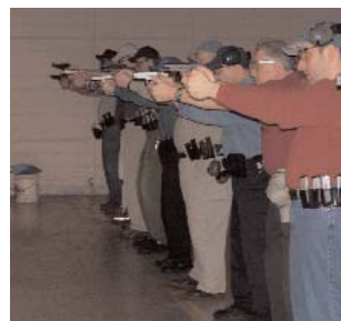
Students on the firing line during an Advanced Combat Pistol Class.

Several courses focused on low-light shooting and survival. From Crimson Trace laser grips to pistol, rifle and submachine gun reduced light tactics with Guy Blocker of OMAI, to instruction on how to select the various electro-optical and sensor devices used in low to no light operations.